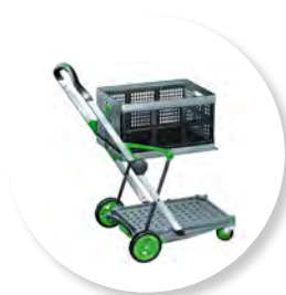
Clax Transport Cart WAT758020