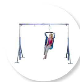
Free Standing Gantry LIC352100